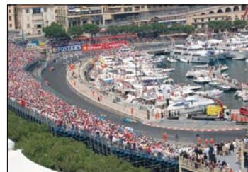
View of Grandstand K